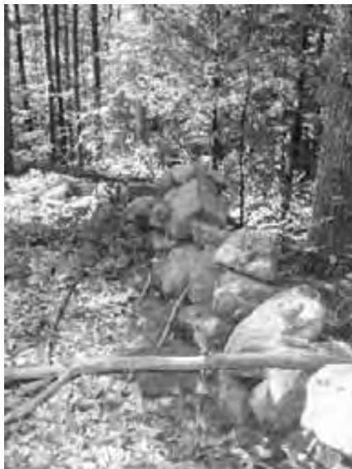
A stone wall lines a path on the new Willoughby easement.